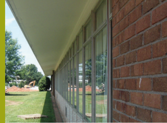
JEFF ROSS-BAIN, PRINCIPAL

A snapshot of current building performance Identifies cost savings A roadmap to sustainability